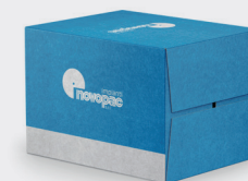
Wrap Around Case